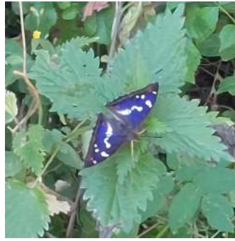
Male Purple Emperor Roger Trout