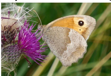
Meadow Brown on Knapweed