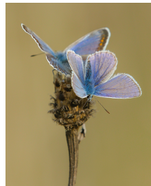
Common Blue on Knapweed