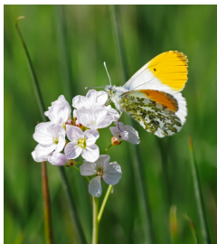
Orange Tip on Lady's Smock