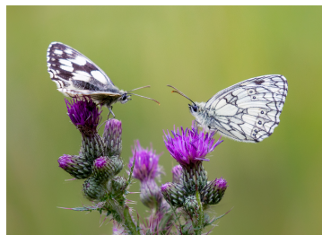
Marbled White on Marsh Thistle